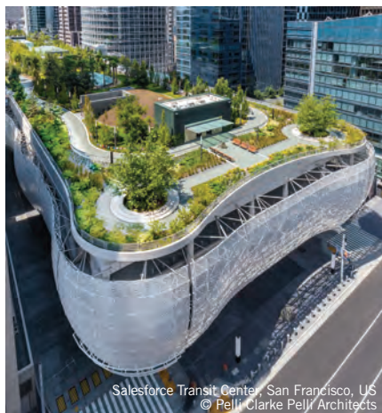
Salesforce Transit Center, San Francisco, US © Pelli Clarke Pelli Architects