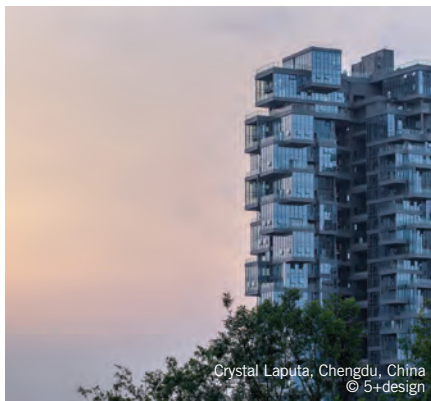
Crystal Laputa, Chengdu, China © 5+design

The shortlist includes projects of all scales and complexities from across the world. All of the shortlisted projects "include buildings that are setting the benchmark for the international architectural community," said the organisers.