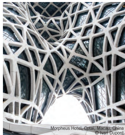
Morpheus Hotel, Cotai, Macau, China