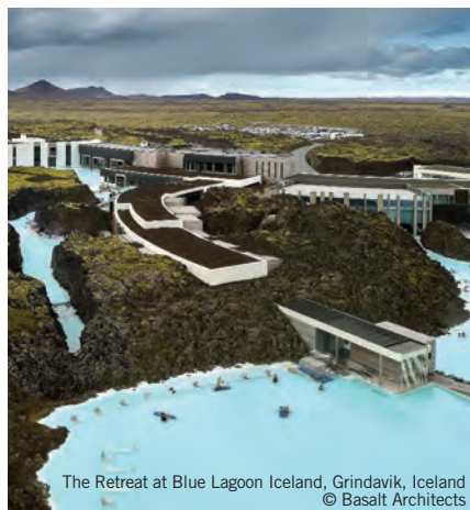
The Retreat at Blue Lagoon Iceland, Grindavík, Iceland © Basalt Architects